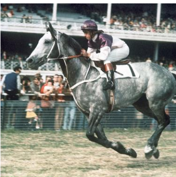
Gunsynd placed. 3rd