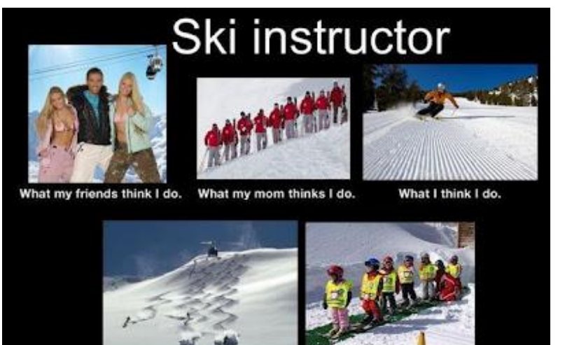
What society thinks I do.

Just in case some of you don't understand what skiing.