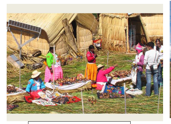
Uros Island, Lake Titicaca

"I've had the most amazing life that anyone could ask for."