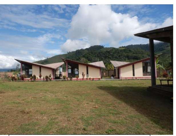
School for the Disabled Satipo Peru